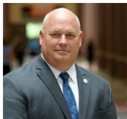
From the Principal