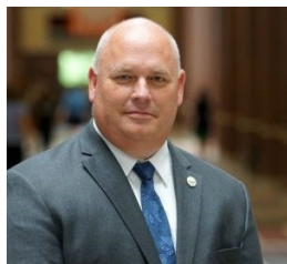
From the Principal