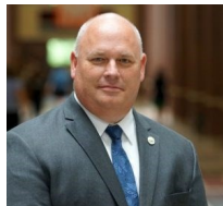
From the Principal