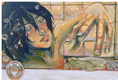
Wren (Maryn) Langlois