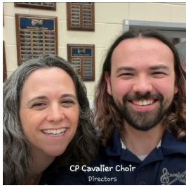
CP Cavalier Choir Directors