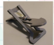
Nail Clipper Aid