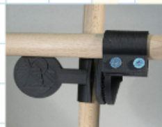
Wheelchair Umbrella Attachment

Our founder is a high school junior with a strong passion for STEM. Motivated by the challenge her sister faced in transporting crutches while using a wheelchair she, along with a friend, designed a mechanism that allows the crutches to attach to the wheelchair when not in use.