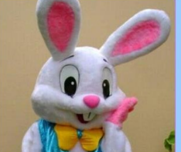
Come join us and take your free family Easter photo with the famous Conroe ISD "Mr. Jimmy" as the Easter Bunny in our spring photo setup!